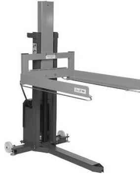
Item no. 275008 Lifting column

For containers size 1.200 x 800 mm or 1.200 x 1.000 mm