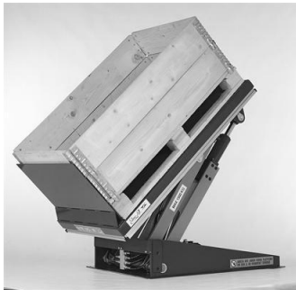
Item no. 275004 table top shape

Front loading Lifting and tilting of pallets