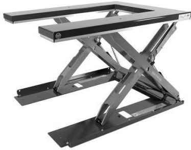
Item no. 275011

For pallets, pallet cages or other containers size 1.200 x 800 mm