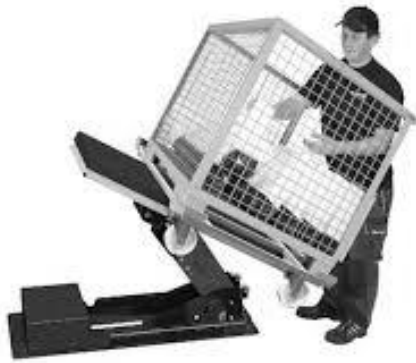
Item no. 275000 Trolley inserted crosswise