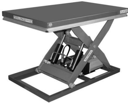
Item no. 275015

For pallets, pallet cages or other containers size 1200 x 800 mm