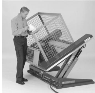
Item no. 275005 U-shape

For pallets, pallet cages or other containers size 1.200 x 800 mm