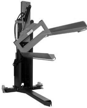
Item no. 275010 Lifting column turnable

Front loading – lifting column Lifting and turning of pallets